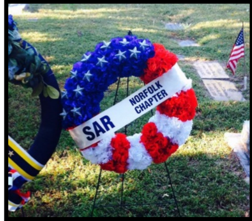
The Norfolk Chapter SAR wreath awaits presentation at the grave of General Thomas Nelson, Jr