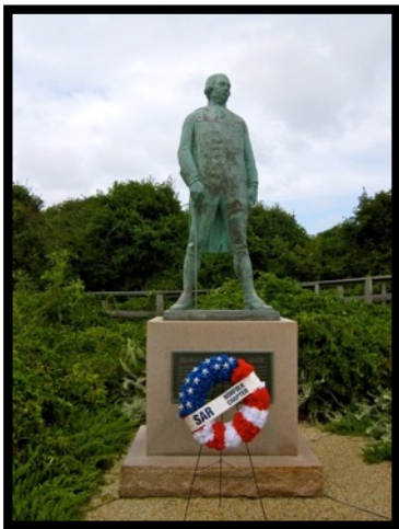
The Norfolk Chapter SAR wreath presented in front of the Admiral deGrasse statue